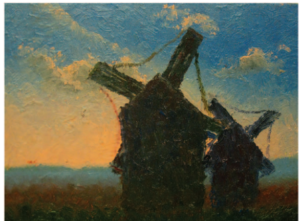
Figure 2. Mills in rural Ukraine (oil painting).